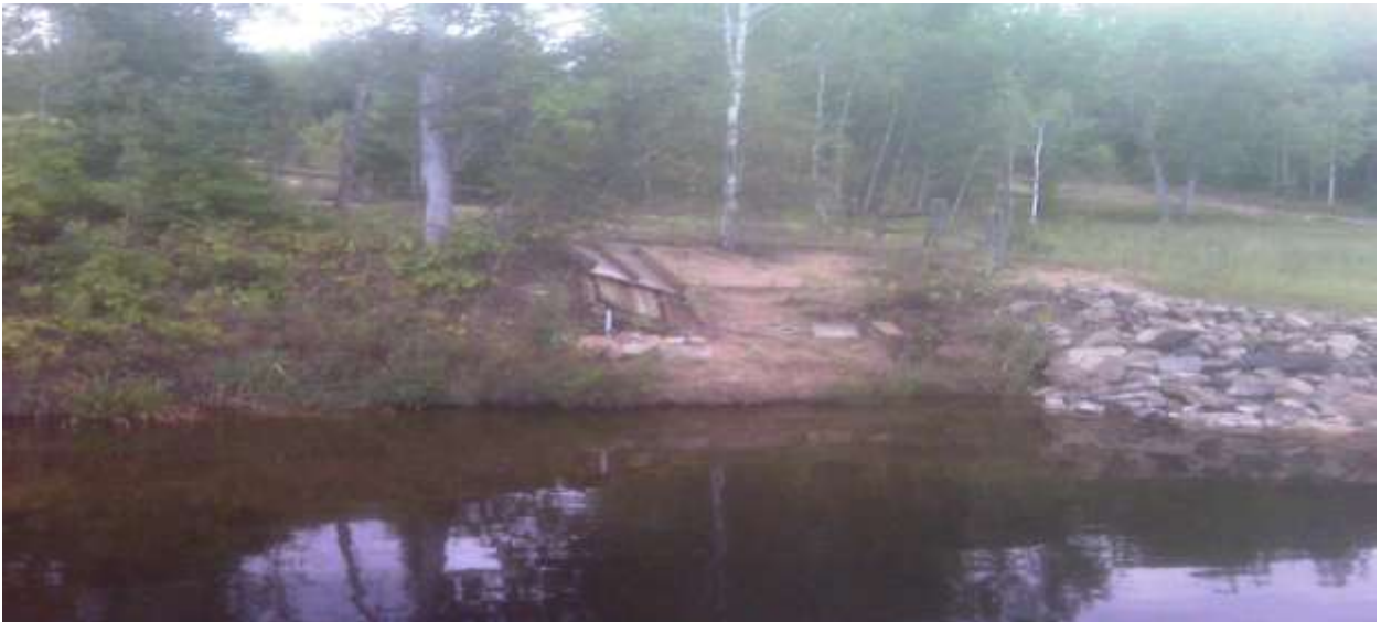
Figure 8 Shoreline areas with steep slope and unvegetated sand contributes to nutrient and sediment loading in Wildwood Lake due to erosion (Photo taken September 5, 2010).

Many point and non-point sources are responsible for nutrient loads to aquatic systems. Many of the homes surrounding Wildwood Lake currently utilize septic systems which can contribute nutrients to groundwater that eventually enter the lake. In addition, some residential lawns are regularly enriched with fertilizers that contain P. Many counties within Michigan are introducing P bans and P-free fertilizers and dishwashing detergents are becoming more available. Storm drains may also contribute nutrients to aquatic systems; however, if nutrient sources are dramatically reduced in proximity to the drains, the effluent is generally not nutrient-enriched and not a threat to the system. Riparian zone (shoreline) vegetation should also be preserved to act as a filter of nutrients that originate in the watershed and eventually enter the lake. In addition, areas with high erosion risk (Figure 8) should be stabilized with vegetation or structural materials to decrease nutrient and sediment loading to the lake. It is recommended that an annual spring septic pump out day be established for all year-long residential homes which immediately border Wildwood Lake and that long-term connection to the sewer line is recommended.