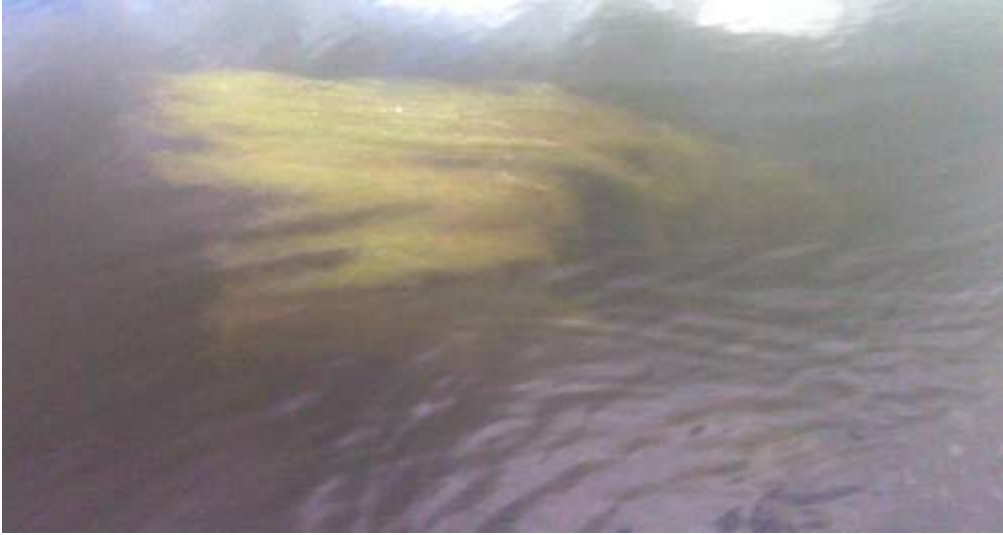
Figure 7. Dense mats of the green filamentous algae, Rhizoclonium sp.