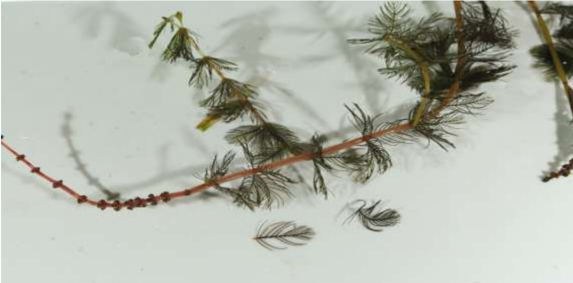
Figure 1. Eurasian milfoil ( Myriophyllum spicatum L.) with lateral branches and seed head.

however, the treatment area should be significantly less as only 4.0 acres of sparse milfoil growth was noted during the September 5, 2010 survey.