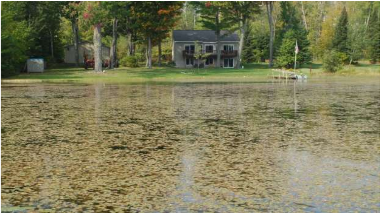
Figure 3. Nuisance floating-leaved pondweed growth in Wildwood Lake, Pre-drawdown, Pre-herbicide, Fall 2009.

During the fall of 2009, an initial lake drawdown was implemented on Wildwood Lake, with the goal of reducing the native exotic milfoil and nuisance native, floating-leaved pondweed growth. Initial pre-drawdown conditions consisted of 52 acres of Eurasian milfoil and approximately 20 acres of heavy floating-leaved pondweed growth (Figure 3). The lake level was brought to normal levels by spring of 2010 although minimal rainfall during the summer still maintained normal lake levels. The drawdown was very successful in the reduction of nearly 17 acres of Eurasian milfoil (as a total of 52 acres were noted during the initial lake management plan study in 2008) and also nearly 10 acres of floating-leaved pondweed (Figure 4). The drawdown process for the control of nuisance aquatic plant growth has been used over the decades with much success (Beard, 1973; Davis et al., 1964; Smith 1971). The Tennessee Valley Authority noted that a lake with a 1.83 meter depth drawdown for a time of 21-25 days during the winter season had a 90% reduction in Eurasian milfoil growth. A similar drawdown with an added 0.5 feet of drawdown depth (relative to 2010) is recommended for 2011 to further control the nuisance milfoil and pondweeds.