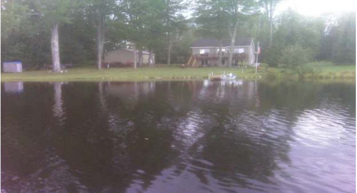
Figure 4. Nuisance floating-leaved pondweed growth in Wildwood Lake, Post-drawdown and Post-herbicide treatment, Fall 2010. Note: Both figures 4 and 5 were taken in front of the same location on the lake.