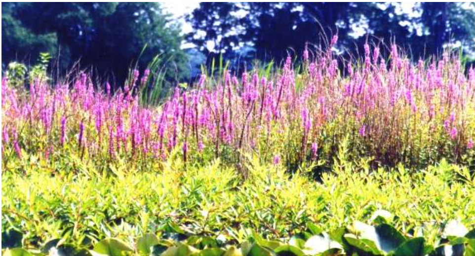
Figure 5. Purple Loosestrife ( L. salicaria )